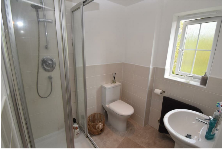
En-Suite Shower Room 6'4" x 5'6" (1.94 x 1.69)

Three piece suite comprising shower, wash hand basin and WC. With tiled splashbacks, a radiator, spotlights, extractor vent and a double glazed front window.