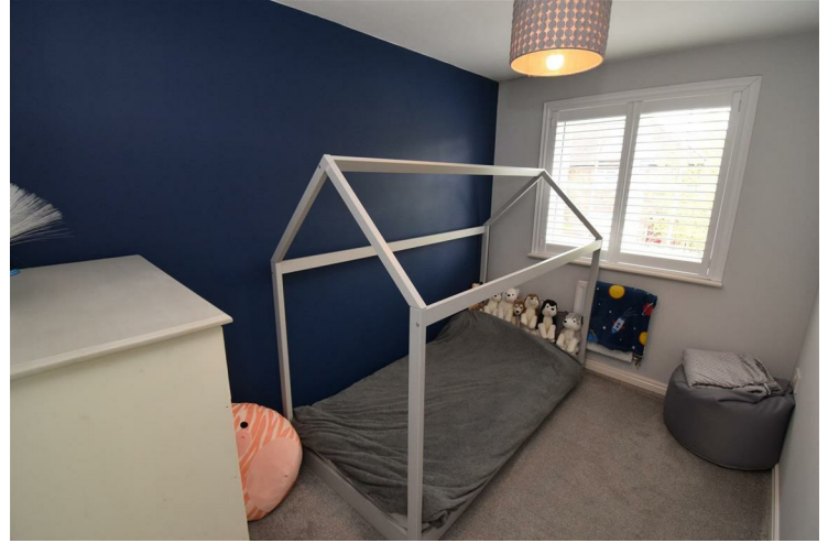
Bedroom 4 9'11" x 8'0">6'9" (3.03 x 2.44>2.08)

Radiator and a double glazed front window.