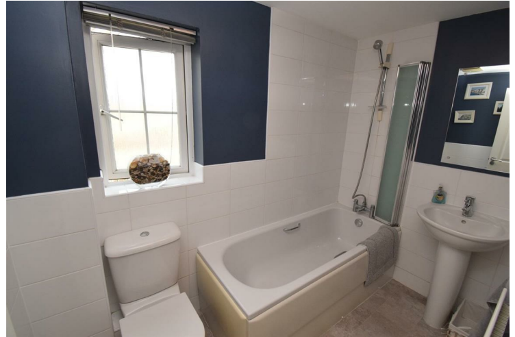
Family Bathroom 8'5" x 5'0" (2.57 x 1.53)

Three piece suite comprising bath with a shower over and screen, wash hand basin and WC. Tiled splash backs, extractor vent and a double glazed side window.