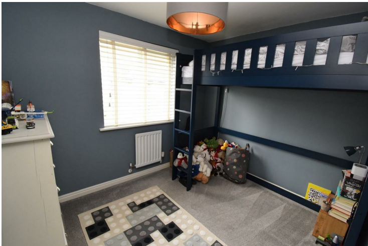
Bedroom 3 9'6" x 7'9" (2.91 x 2.37)

With a radiator and double glazed rear window.