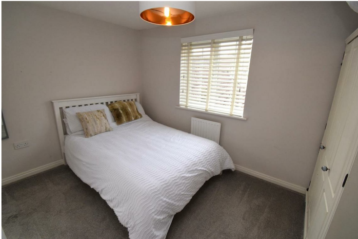
Bedroom 2 11'11" x 11'6">7'9" (3.64 x 3.53>2.37)

L-shaped bedroom with a radiator, double glazed side and rear windows.